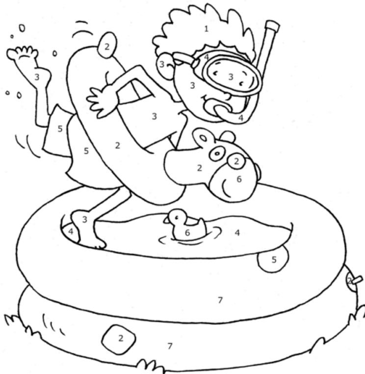
Swimming Color by Numbers

Stop by the Mojave Branch for more fun activity pages!