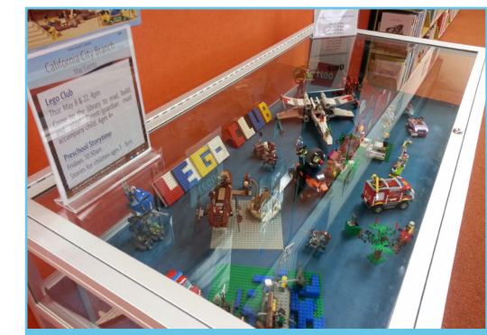
LEGO CLUB Build a creation using your imagination! Look inside for more details.